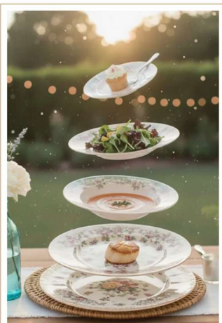
Plates by Course

We welcome you to bring your own linens and decorations.