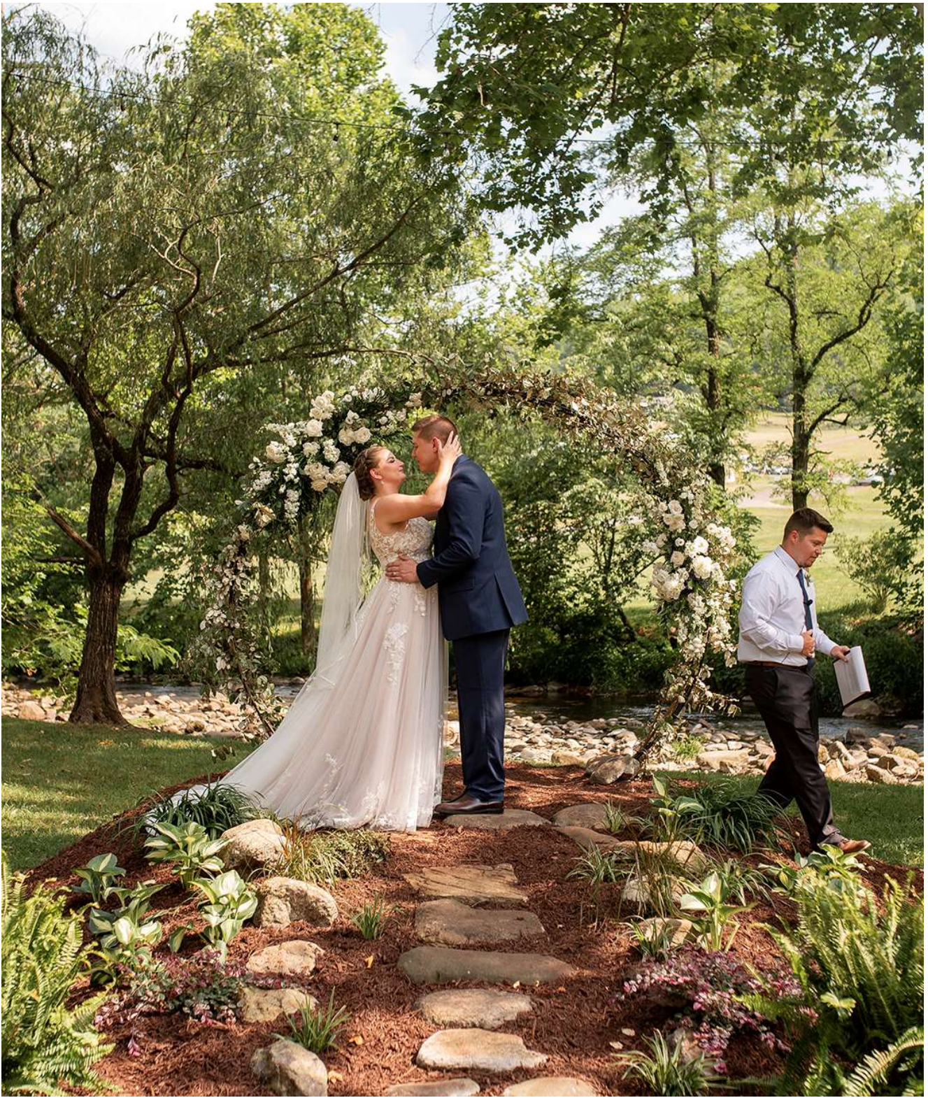
STREAM-SIDE CEREMONY BY SYCAMORE PAVILION