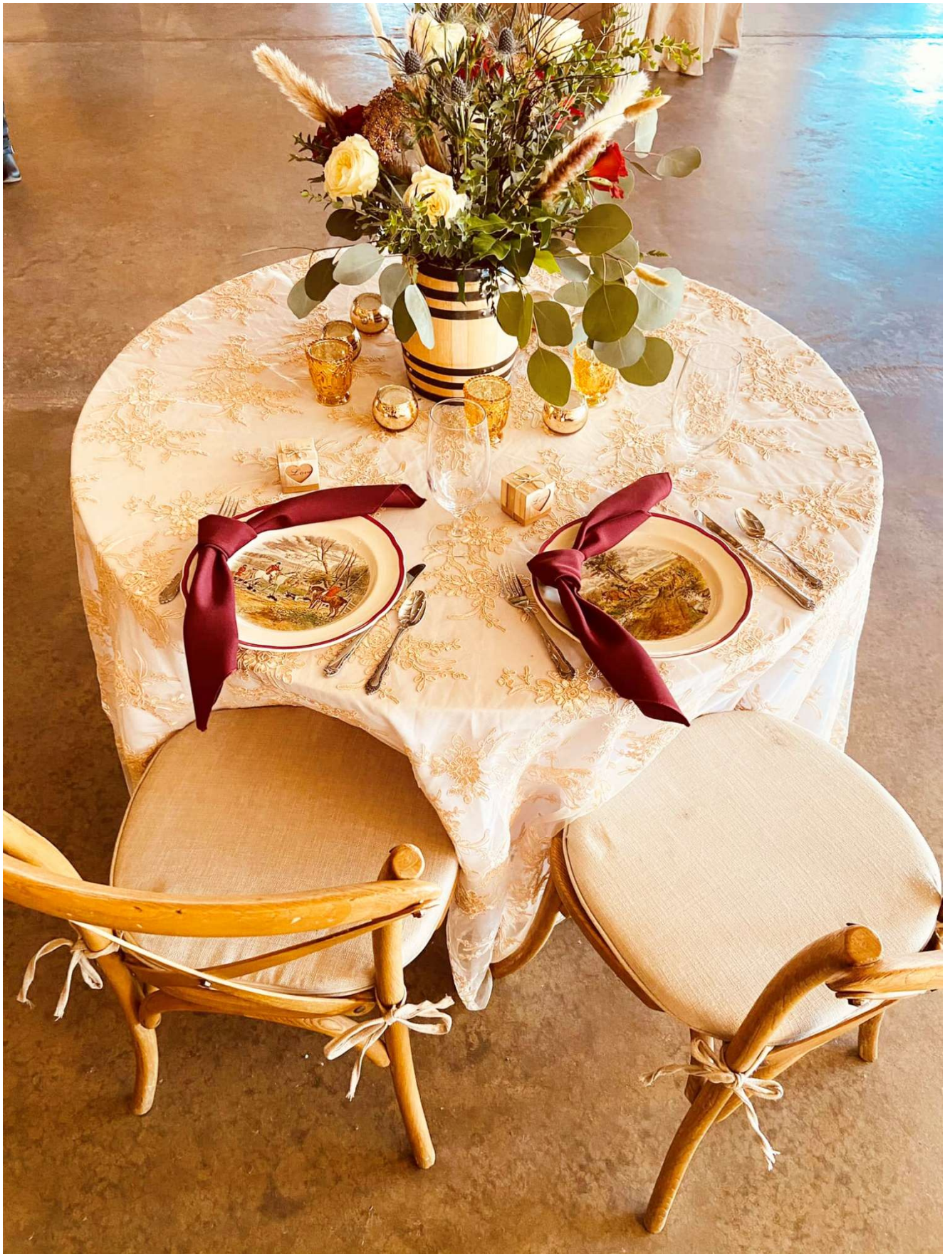
SWEETHEART TABLE AT SYCAMORE PAVILION