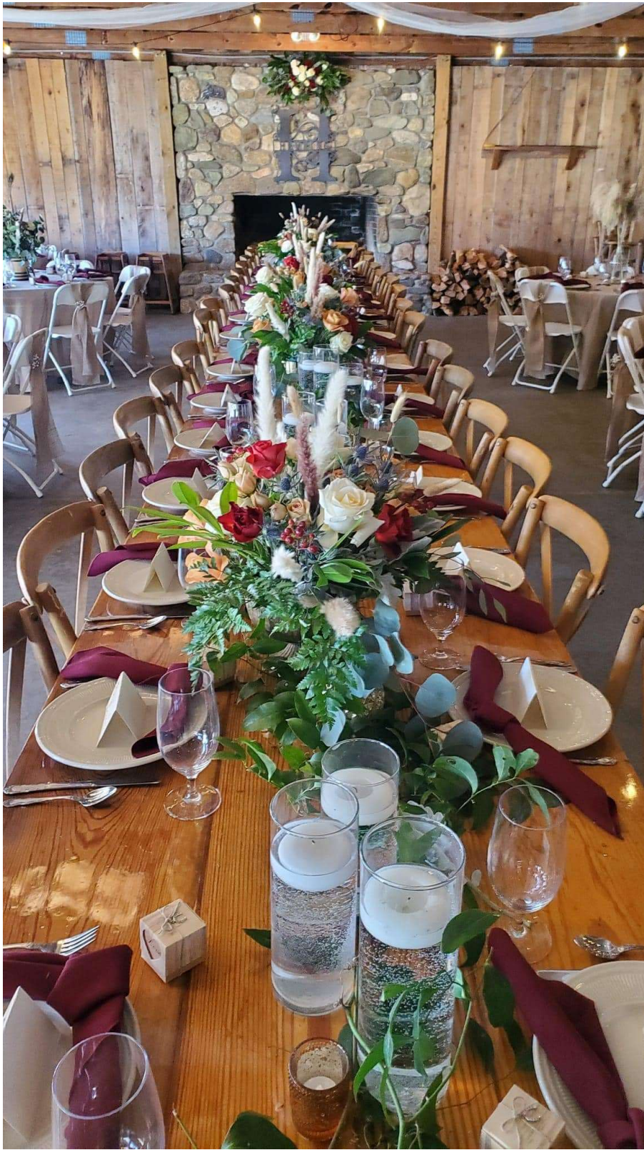
SYCAMORE PAVILION BY ROSE RIVER