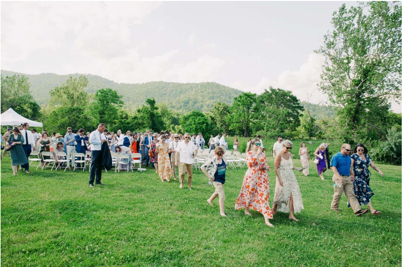
HONEYSUCKLE FARM CEREMONY

We have limited décor but then our pricing reflects that.