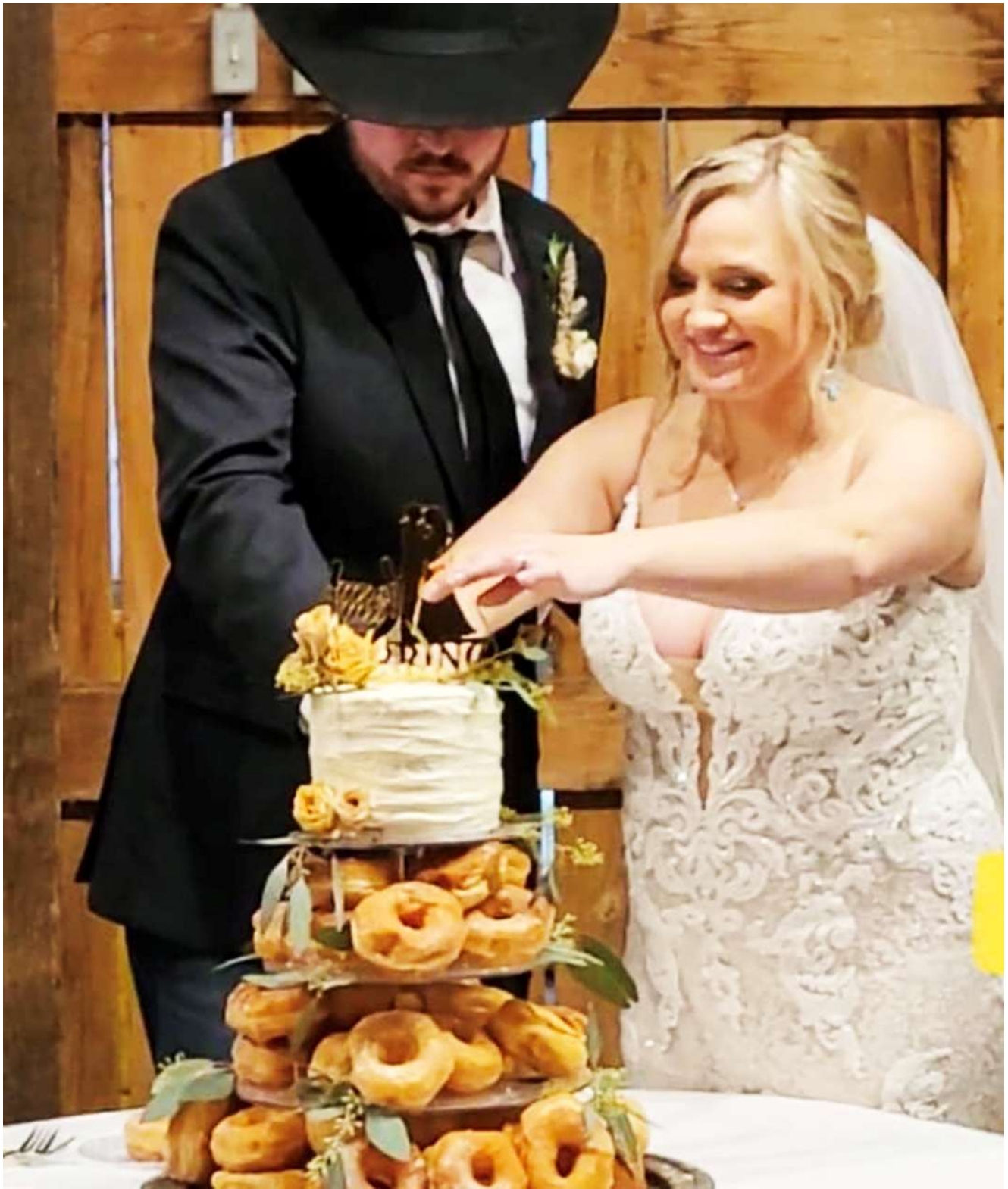
DOUGHNUT CAKE CUTTING AT SYCAMORE PAVILION