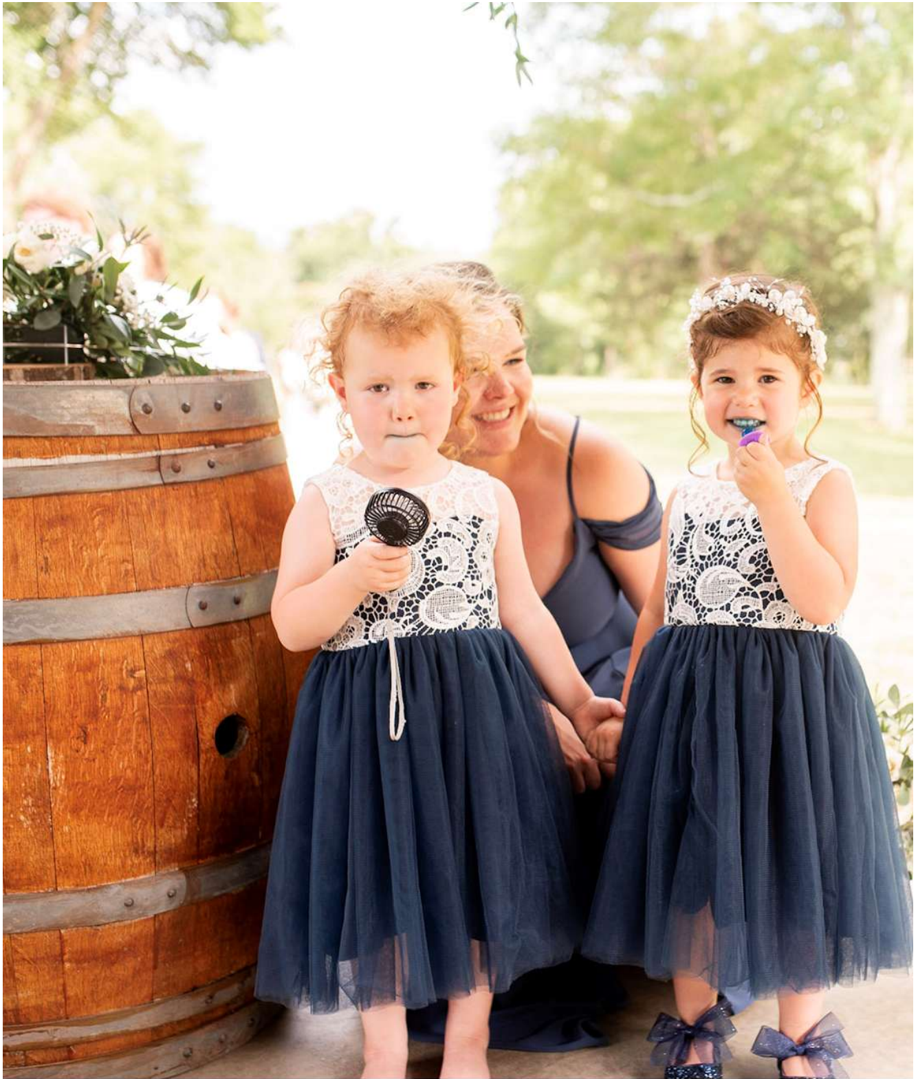
THE JOYOUS YOUNG ONES