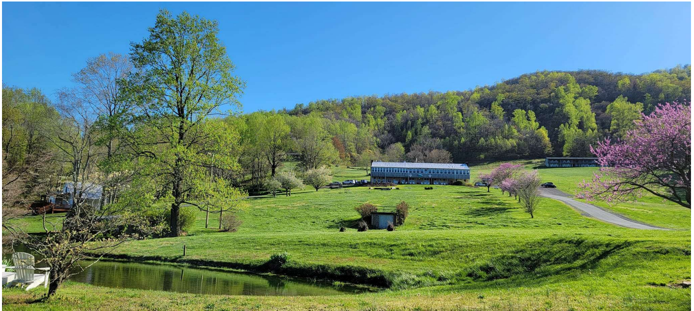
SPRING - LODGE LAWN, DOUBLETOP MOUNTAIN BEHIND